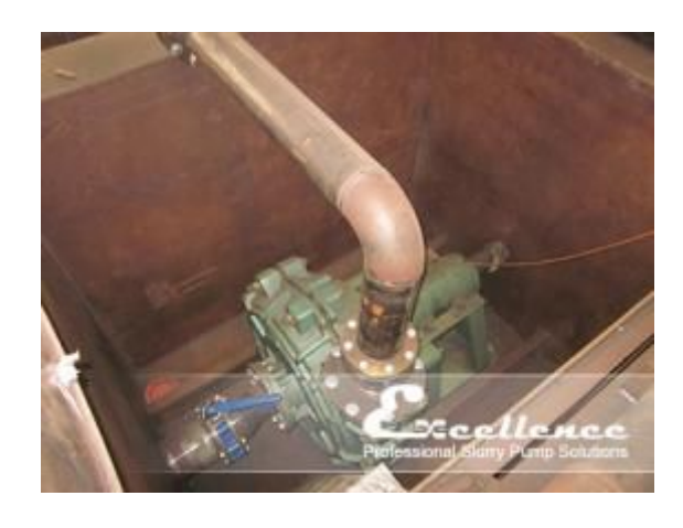
EGM-6S Coal Washery in Australia