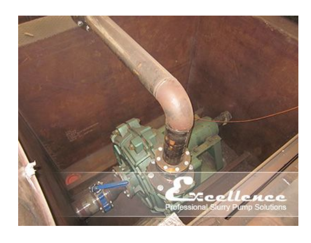
EGM-6S Coal Washery in Australia